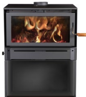
Boxer 24 with optional Pedestal Base

Use 33% Less Wood Our unique combustion system makes the Boxer one of the most efficient wood stoves in the world, thus lowering your heating costs.