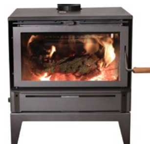
Boxer 24 with optional Leg Base